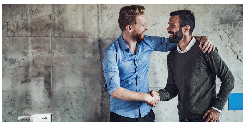
Congratulations! You have joined the millions of Canadians who enjoy life without smoking.

Rely on tools. Use all the tools you can to stay on track: this booklet, your doctor or pharmacist, quit aids, online support and the people in your life. Call the national quitline to talk to a supportive, non-judgmental quit coach.